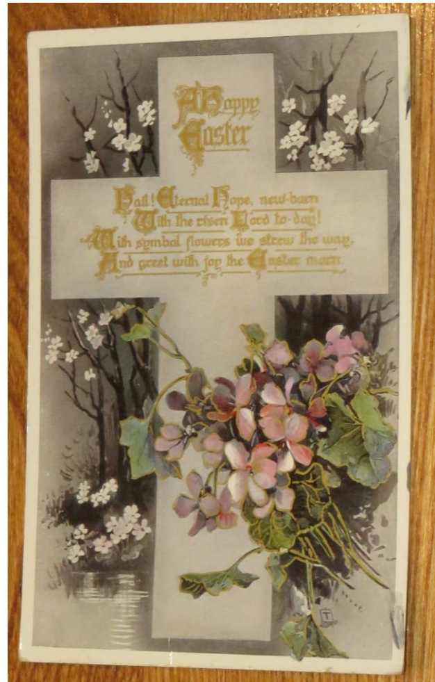
Unusual card of woman with hair, and Easter card. No names were on either card.