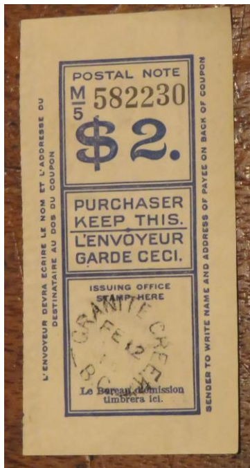
Two dollar money order with the Granite Creek Post Office stamp on it from February, 1912.