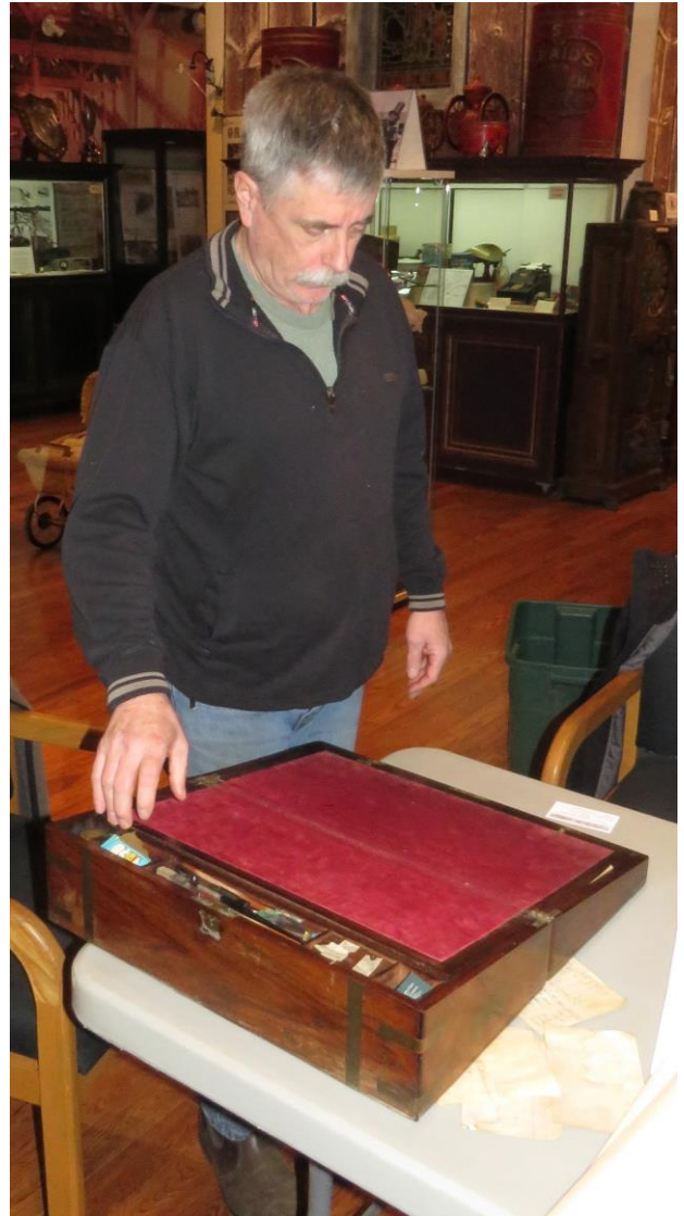
And it wasn't empty! The desk was full of more treasures: